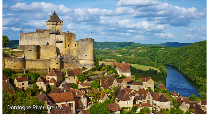
Dordogne River, France